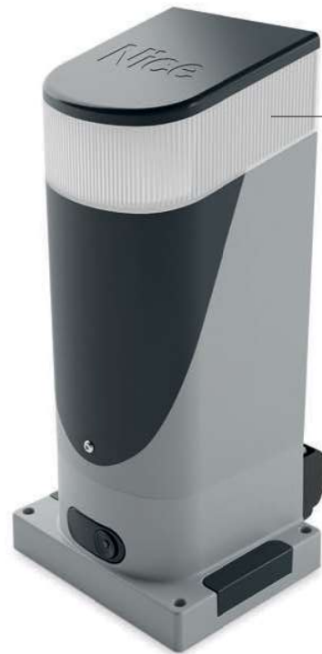
Courtesy or flashing LED light

Practical: control unit and optional PS124 buffer batteries can be connected by means of practical guided - connector.